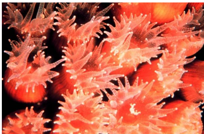
Figure 3. Cavernous Star Coral ( Montastrea cavernosa ) in the Florida Keys National Marine Sanctuary.